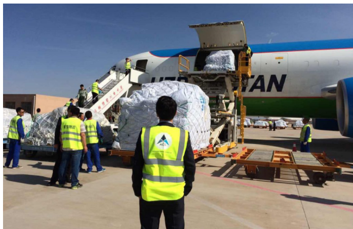
ACS worked on the cargo pictured here together with the Chinese Government for a flight in Lanzhou, China via 767

We have found that the best way to overcome permit difficulties is to directly engage, politely and sincerely, with the civil aviation authorities and to gain an understanding of what each requires when processing an unscheduled flight application.