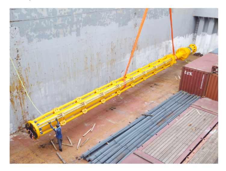
This 24 metre long, 38 tonne telescopic joint was loaded on the ANL Dili Trader.

Two extremely large reels weighing 128 tonnes and 138 tonnes each were loaded on the ANL Darwin Trader at Jurong Port for carriage to Darwin.