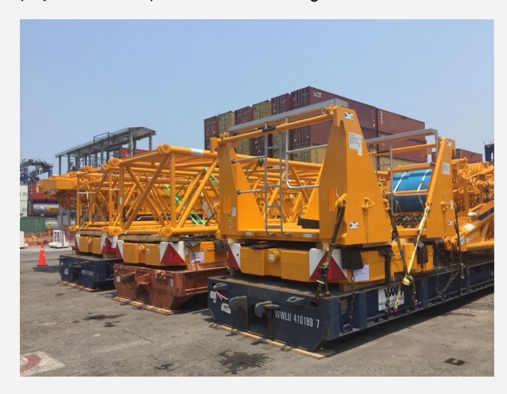
If a customer has an inquiry that calls for inland transport in Mexico is that something that you can help with?

Aside from BIMCO we are also members of the Mexican Ship Agents Association (AMANAC), where we have been active members and members of our staff have been president two times and served as members of the board several times. Transpac is also involved with the Mexican Import and Export Association (ANIERM) where we receive feedback from and help the foreign trade community fulfill their needs. We regularly help with projects that competitors are afraid to get involved in.