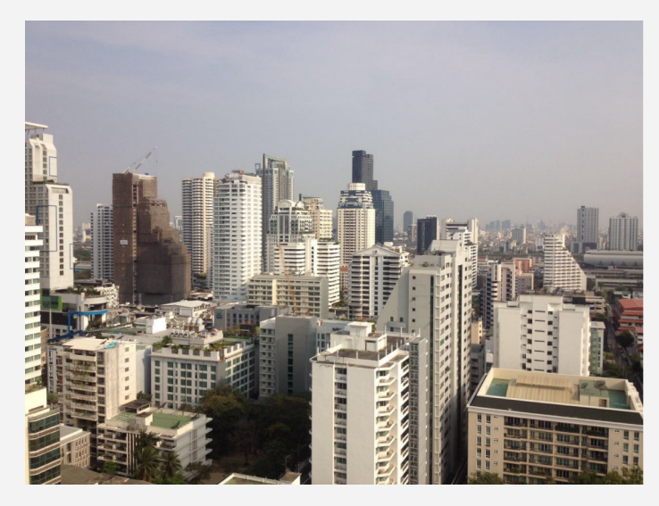
What did you find most interesting about your Shipping career abroad?

Naturally many of our closest associates, competition, and the relevant decision-makers for SE Asia were based rather in Singapore, so this did become a common comparison as well an oft-asked question as to why Thailand. There is an original story, and related piece of business, which led to Nordana putting down their regional office roots in Bangkok, but that's for another time and storyteller. As for myself in brief, I enjoyed the people, culture, vibrancy and variety, ability to drive outside the city to some rural/scenic/natural spaces, all while just a hop, skip, and a jump away from other Asian metropolises and/or beach/island paradises.