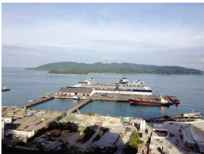
A luxury cruise-liner alongside the pier in Kota Kinabalu, Sabah, Malaysia