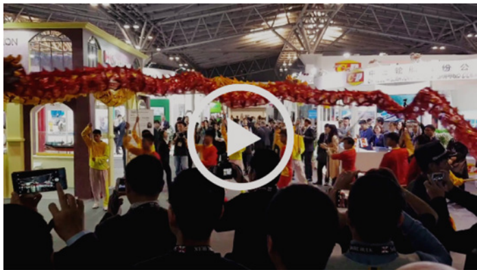
The opening dragon dance at Breakbulk in Shanghai last week