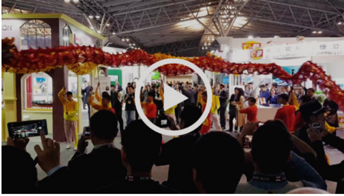
The opening dragon dance at Breakbulk in Shanghai last week