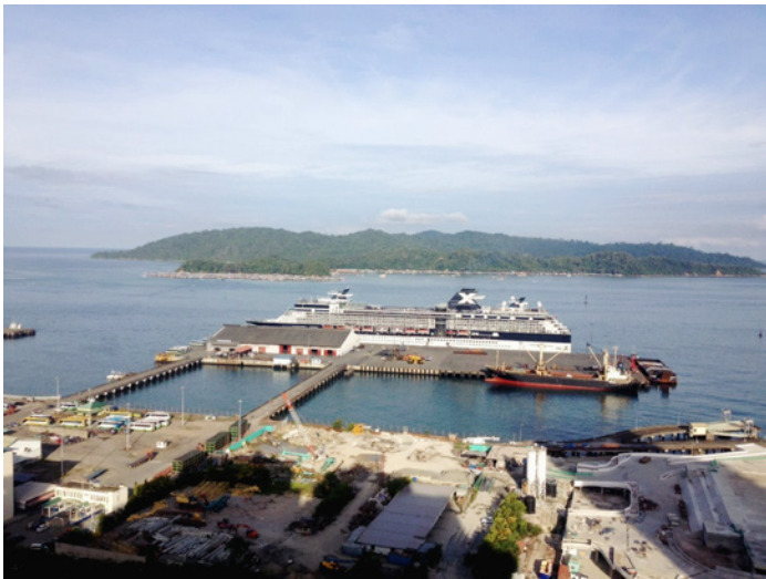
A luxury cruise-liner alongside the pier in Kota Kinabalu, Sabah, Malaysia